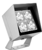
Anti glare visor